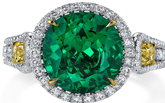
This stunning 5.55 carat tsavorite garnet is set in platinum with two fancy yellow diamonds weighing a total of 0.71 carats and 136 round diamonds weighing 1.02 carats total weight.

The birthstone for January is also found in Myanmar, Brazil, Iran, Afghanistan, Pakistan, India and Sri Lanka, among other countries.