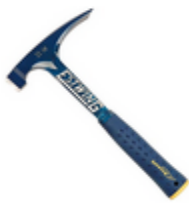
Bricklayer / Mason's Hammer

But before you get your hands on a rock hammer and start banging it against rocks, you should have some idea of how properly use these very important tools. Here's a quick reference chart: