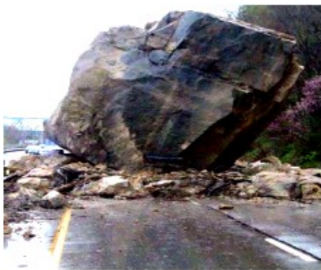
Currently sitting on US 52 in Ohio just across from Ashland KY. Witnesses state a coyote and a roadrunner were near the scene moments before this huge boulder fell to the road.

Reprinted from the Central Ark Rockhound newsletter from fall, 2015: