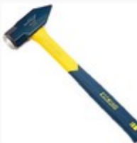
Cross Peen Hammer

What's the best, single resource guide? Estwings Geology section of their website. Estwing is probably the most well known name of hand tools around, and definitely so with respect to geology tools. Most of us probably have the familiar blue handle, but they also make an orange which probably isn't so easily lost (for $10 more!) and classic leather wrapped handles, as well.