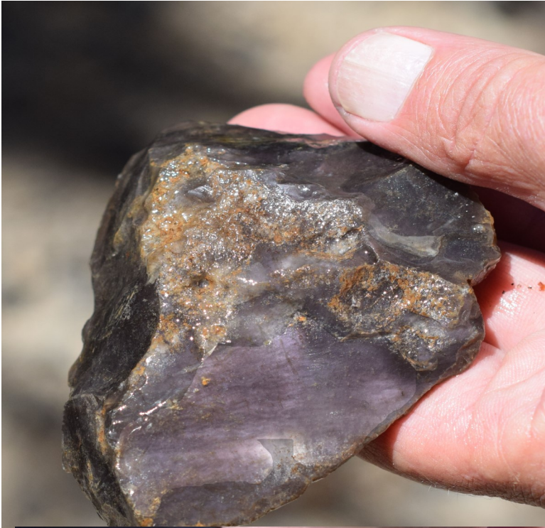
Left: pink lady