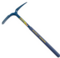
Geo/Paleo Rock Pick