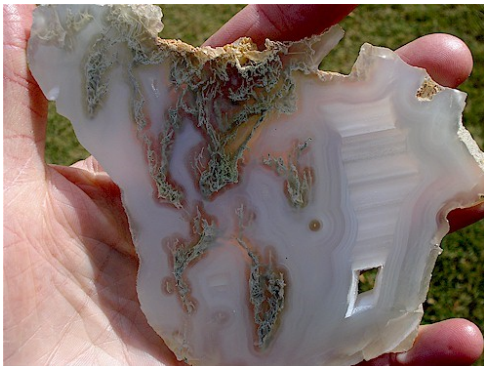
Visit their website rarerocksandgems.com to find pieces for purchasing.

➤ On Saturday we were told to bring water & lunch for the field trip out to hunt for Ochoco tube agate. At 7:30am the cars & trucks lined up and by the time we left, there were 42 travelers heading for the unknown. The leaders were knowledgeable, polite and had dug the area with machinery making it easy to locate the agate. I personally found a piece about the size of a 5 lb bag of sugar. The whole weekend was fun and the field trip (one of three offered) was a bonus. Ready for next year!