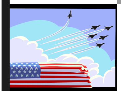
Inside this issue: