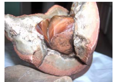
Mystery Rock from Tuledad Field Trip